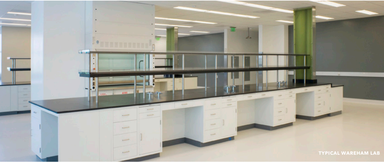
TYPICAL WAREHAM LAB